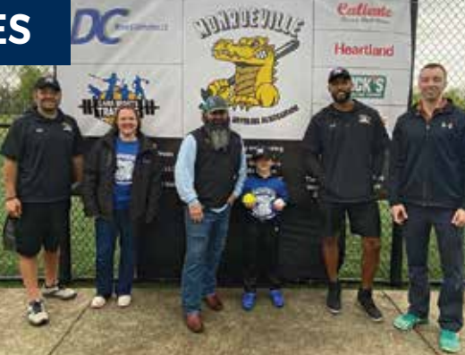
I attended the opening day festivities of the Monroeville Baseball & Softball Association. Best of luck to the players and coaches this season!