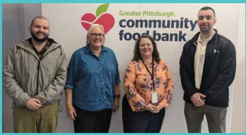
I toured the Greater Pittsburgh Community Food Bank's warehouse and spoke to the staff about the resources they can provide our communities.

If your household has been impacted by the reduction in SNAP benefits, I want you to know that local food banks and multiple programs are available to help with access to nutritious food. Learn more about assistance programs and resources at www.agriculture.pa.gov/food_security.